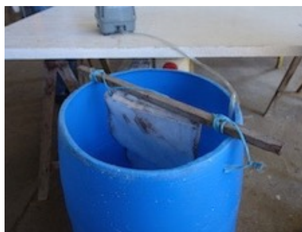
Harry Kibbler's basic Compost Tea setup. Compost tea is used in dilution to improve the soil.

After the tour we sat down to a meeting with a cuppa. It was then time to head into town, change clothes at the motel, buy some breakfast items at the supermarket across the road and make my way to the Star Hotel for dinner. There were 16 of us at a couple of large tables on the closed in verandah and a great night was had by all. Many growers had travelled large distances that day and were keen to catch up with colleagues.