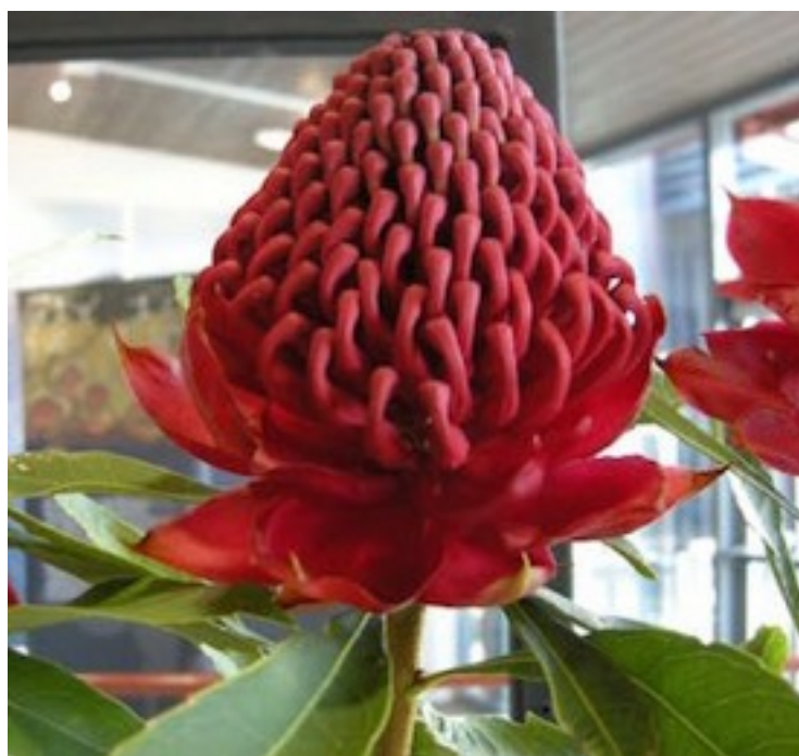
Telopea speciosissima 'Mirragon'

Share this newsletter with friends, colleagues and other garden lovers. Encourage them to join.