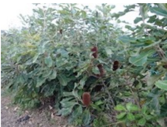
A row of Banksia robur caught my attention

Thank you to the three growers and the organisers of the weekend for allowing me to participate. I was very impressed with the range of plants being grown and the persistence required to overcome pests and weather events. I wish everyone an excellent season and a bountiful harvest.