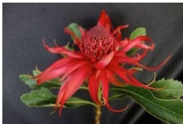
Telopea speciosissima 'Scarlet Ribbons'

Isn't it terrible when you copy something from the web and then can't find it again. Does anyone know anything about this variety, Telopea Scarlet Ribbons?