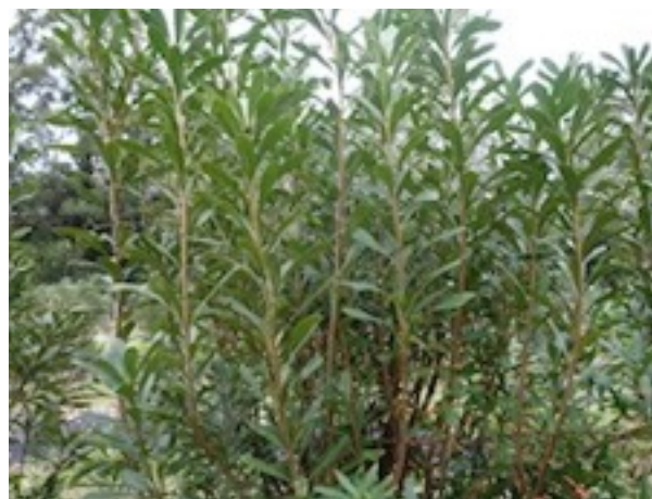
Telopea speciosissima Mirragon with vigorous upright stems

of Waratahs was the row that had no weed mat but instead he had added a thick mulch of hardwood chips and he fertilised the row with blood and bone. Telopea Mirragon was his favoured variety.