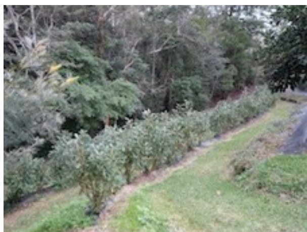
A row of Shady Lady waratahs in a sheltered position on the Robinson farm