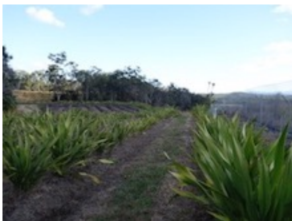
He has hundreds of Gynea Lilies planted in rows.